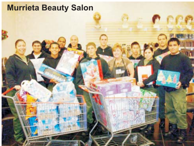
Murrieta Beauty Salon