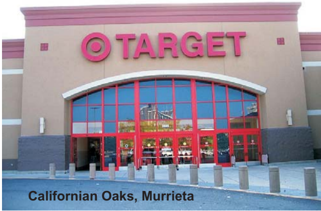
Californian Oaks, Murrieta