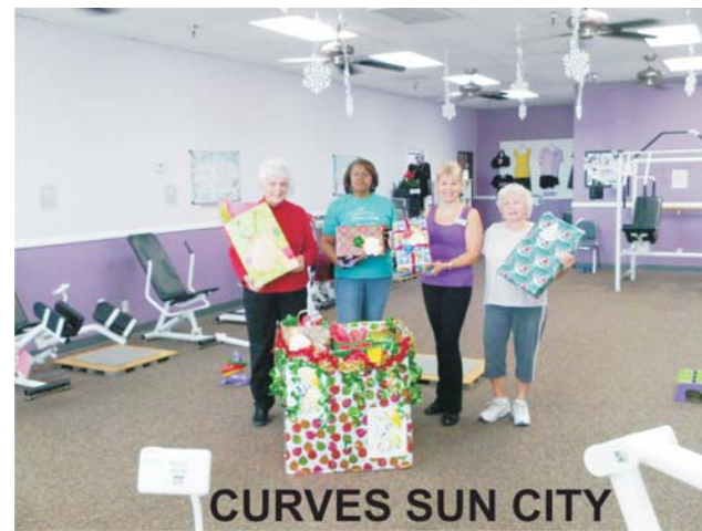
CURVES SUN CITY